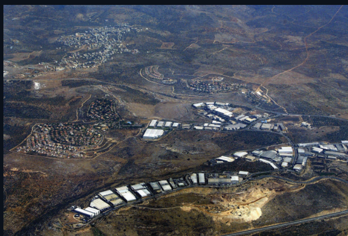
Barkan, located in the occupied West Bank, is an Israeli residential settlement and industrial zone that houses around 120 factories that export around 80 percent of their goods abroad. In the background is the Palestinian village of Qarawat Bani Hassan.

Because the violations described in the report are intrinsic to abusive, harmful, and long-standing Israeli policies and practices in the West Bank, it concludes that the only way settlement businesses can comply with their responsibilities under international human rights standards is by ending their businesses in settlements or in settlement-related commercial activity.