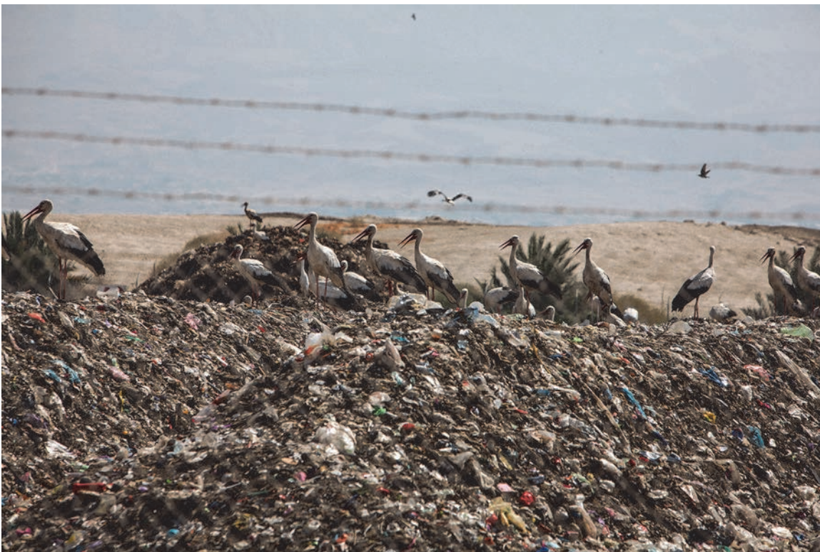
Storks rest on mounds of garbage in a landfill in the Jordan Valley. Located in the occupied West Bank, the landfill exclusively services Israel and settlements.

The harmful impact of Israeli settlements and their residents extends beyond the land on which their houses are located. Settlements require roads, transportation systems, telecommunication services, and other goods and services. Private actors provide many of these needs, thereby contributing to the unlawful confiscation of Palestinian land and resources. These companies also facilitate the presence of settlements by making them sustainable. In Human Rights Watch's view, businesses servicing settlements often benefit from Israel's discriminatory policies and practices that harm Palestinians while privileging Jewish Israelis.