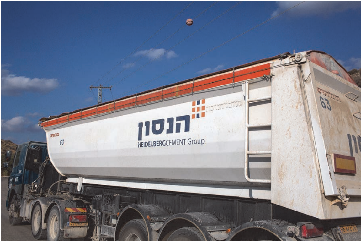
A Heidelberg Cement Group truck, which says “Hanson” in Hebrew, leaves the Nahal Rabba quarry.

security interest in the area, or on the interests of the local population, even if the army's needs are its military needs and not national security needs in the broader sense. A territory held through belligerent seizure is not a field open for economic or other exploitation. 114