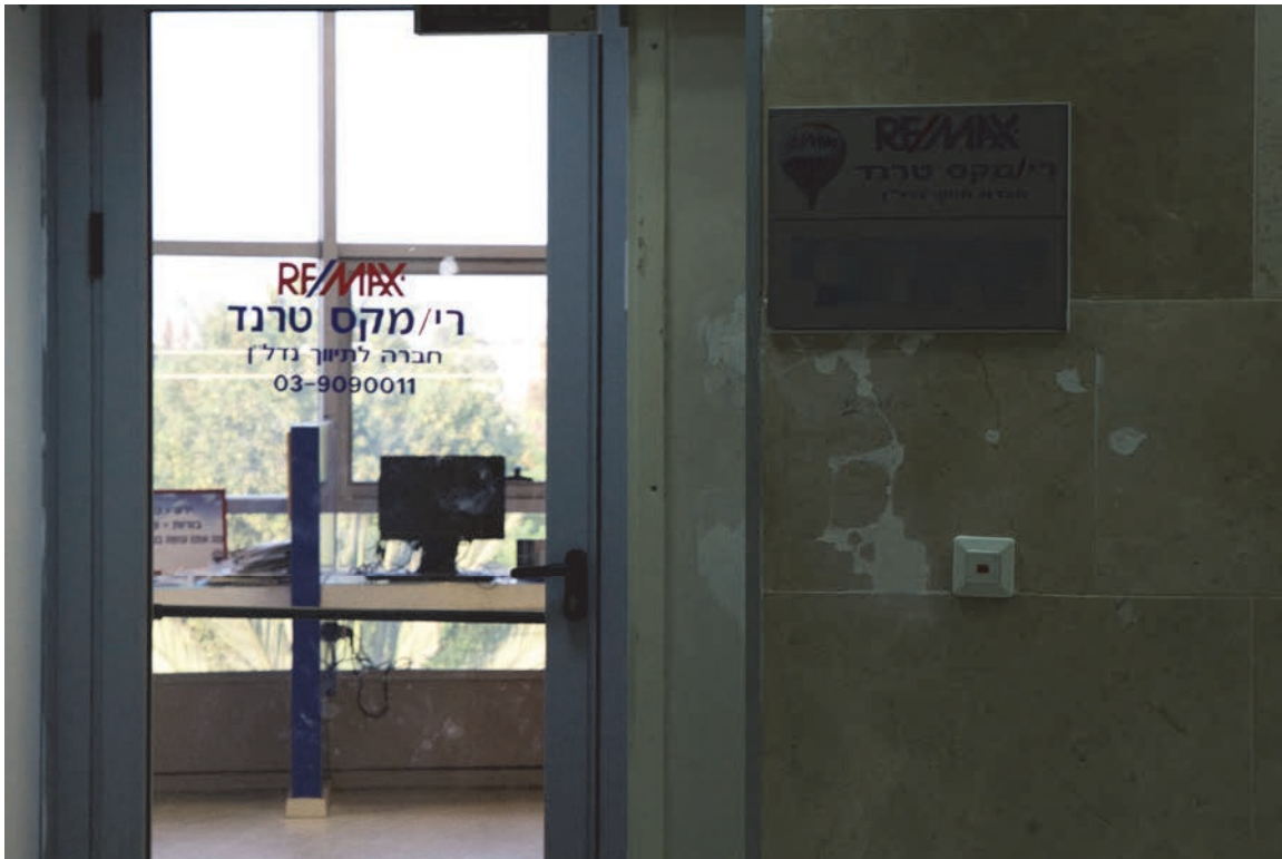
RE/MAX Trend, a branch of a Colorado-based real estate franchise located in the Israeli town of Rosh Ha’Ayin, sells and rents homes in the settlement of Ariel. RE/MAX also has a branch in the settlement of Ma’aleh Adumim.

according to its website; the franchise encompasses some 100 branches. 168 One of those branches is located in the settlement of Ma’aleh Adumim, and several other branches offer properties for sale or rent in settlements. 169 The number of homes that RE/MAX offers for sale or rent in settlements varies; in November 2015, for example, it listed 80 properties in 18 settlements on its Israeli website. 170 These listings included 12 properties in Ariel, at a total value of more than 13 million shekels ($3.25 million). 171